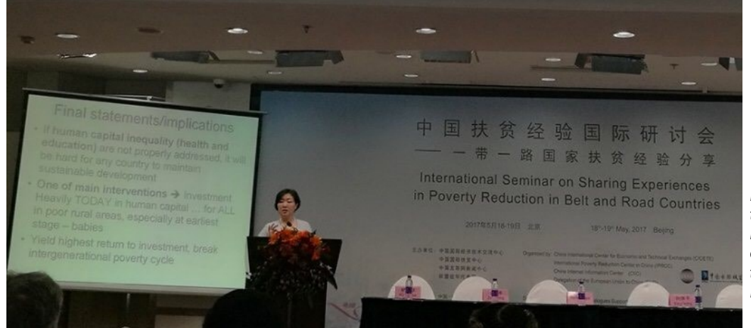
Prof. Linxiu Zhang delivering the keynote presentation during the International Seminar organized on the sidelines of the Belt and Road Summit.

Emphasizes on the need to enhance public investment on rural human capacity