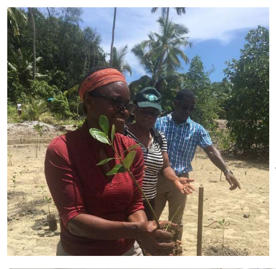
Seedlings planting activity led by Na-Mantional groves Restoration Expert in Seychelles under the EbA South project.