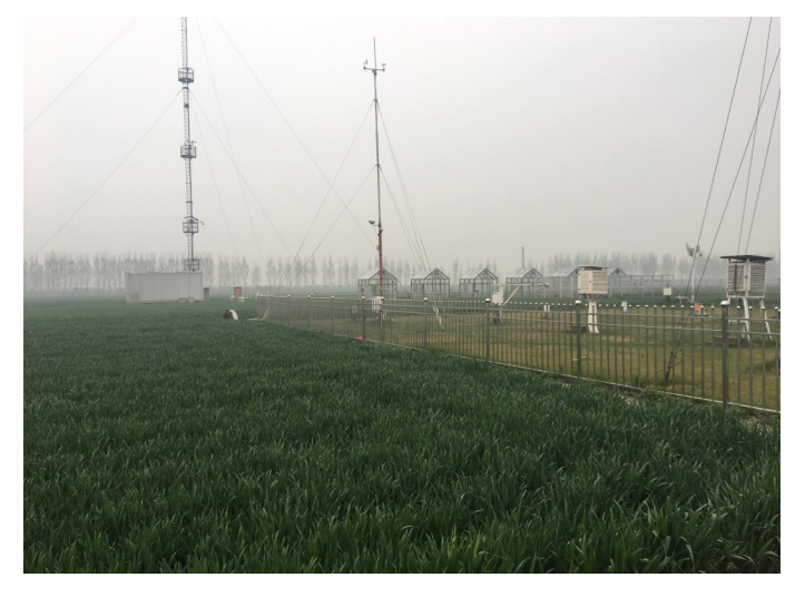
Wheat plantations managed by the CERN Luancheng Station.

Until date, the station has collaborated and communicated with international partners from more than 20 countries and nearly 30 research institutions.